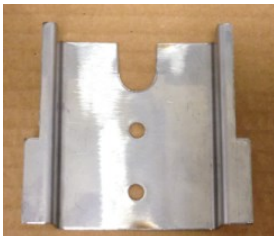
Rotisserie motor bracket