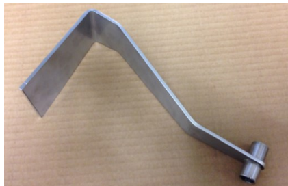
Rotisserie rod holder