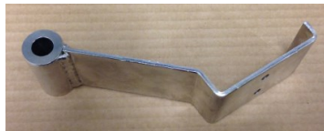
Rotisserie motor body arm