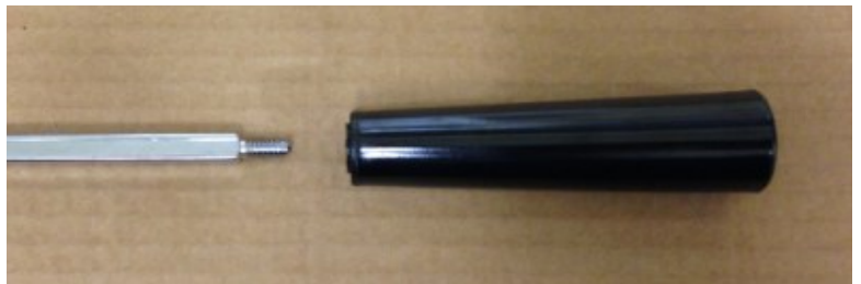
Left hand motor arm

CAUTION: Do not use the handle in the firebox. This is for use when removing the rotisserie from the fire.