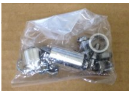
Screws for fastening