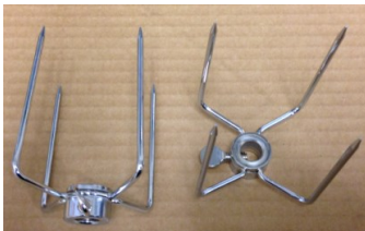
Rotisserie 4 prong skewers