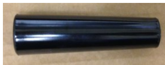
Rotisserie rod handle