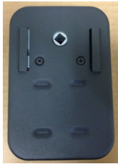
Rotisserie Motor - rated to 4kg

Requires 2 x D size batteries (not incl).