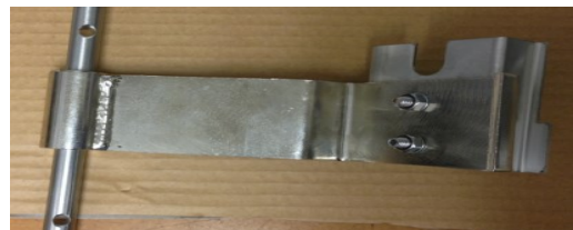
right hand photo

Step 6: Place the motor body arm on the davit rod with the cut out for the rotisserie rod to the top.