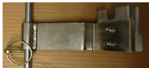
right hand photo

Step 7: Re-insert the linch pin at the desired height. Place davit rod back into the firebox