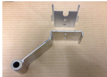
right hand motor bracket

Insert the screws supplied and do up tight with the use of a screw driver and crescent.